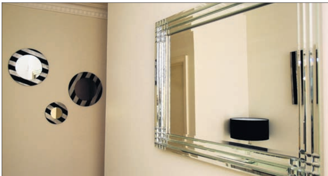
Glass act: Mirrors can reflect well on your creativity by allowing more light to fall on displays.