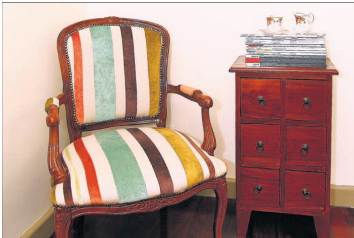
In the mood: The way objects are placed together can influence the mood of a room.