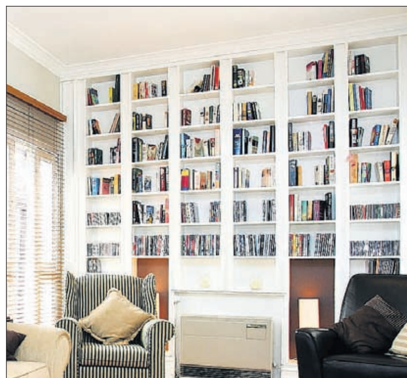
Thoughtful arrangement: Even books can be made a living room feature.